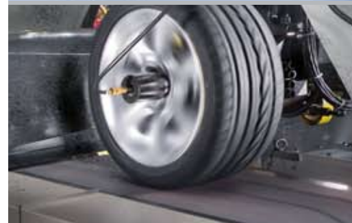
(c) IABG mbH - IABG Flachbahnreifenprüfstand Flat-Trac (R) III CT - München/Ottobrunn